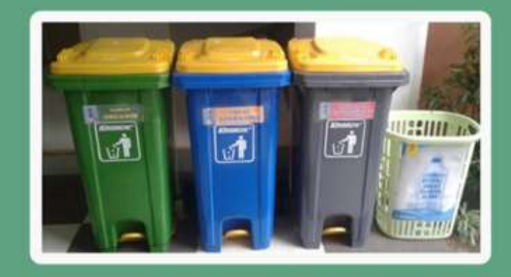
Inorganic Waste Management at University of Indonesia

About 50-75% of inorganic waste in University is treated. Example about how inorganic waste treated in University is shown below.