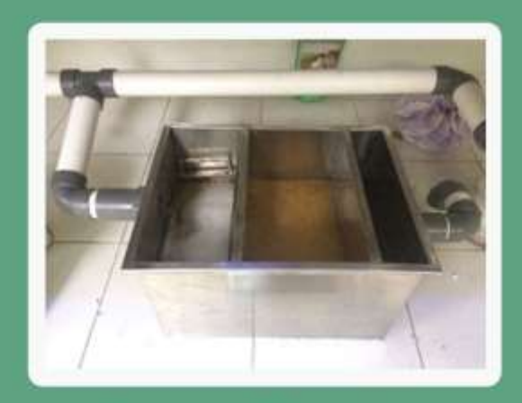
Sewerage Disposal at University of Indonesia