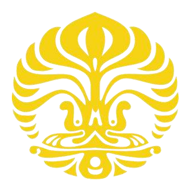
University of Indonesia Logo

Those institutes of higher education were Technische Hoogeschool te Bandoeng (Faculty of Engineering) which was established in Bandung in 1920, Recht Hoogeschool (Faculty of Law) in Batavia in 1924, Faculteit der Letteren en Wijsbegeerte (Faculty of Letters and Humanities) in the Batavia In 1940, and one year after that Faculteit van Landbouwweteschap (Faculty agriculture) was established in Bogor. These five institutes of higher education became the pillars in developing Nood-(Emergency universiteit University) which was established in 1946.