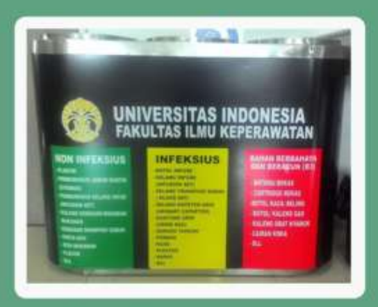
Toxic Management at University of Indonesia

More than 75% toxic waste in University is treated and recycled. The handling of toxic waste at University is carried out by separating or grouping the toxic waste. All toxic waste is handled separately and disposed of with special handling by the K3L team. Sewerage disposal is treated technically using a grease trap before being discharged to septic tanks, so that the waste can be handled separately by DPPF UI.