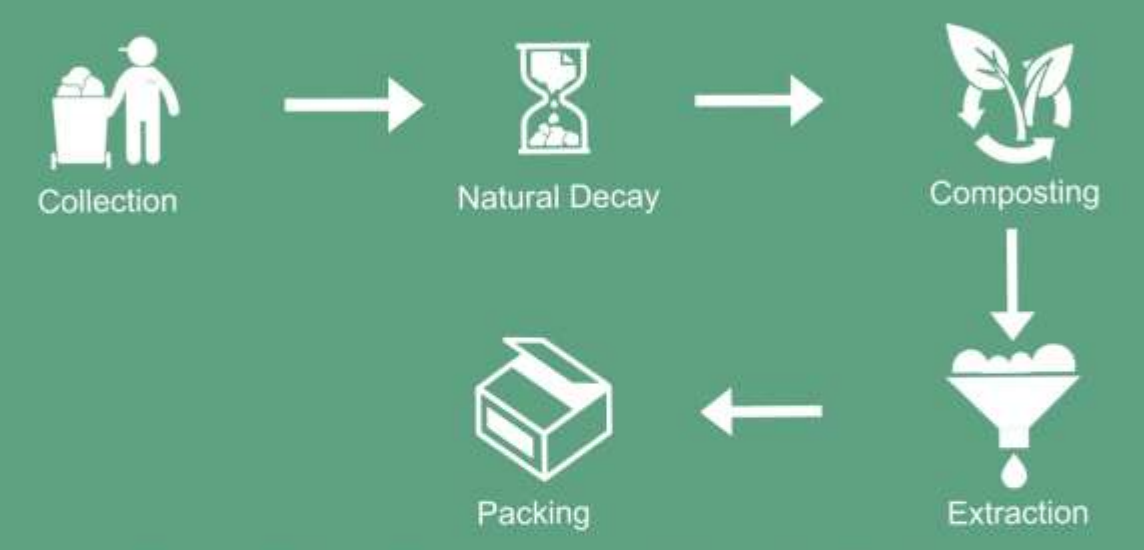
Organic Waste Management at University of Indonesia

About 50-75% of organic waste in University is treated. Almost all organic waste processed with Dry Aerobic Digestion (DAD). Almost 90% of the total waste is converted into compost and the rest is sent to the UI Waste Bank. Ilustration about how organic waste processed in University is shown below.