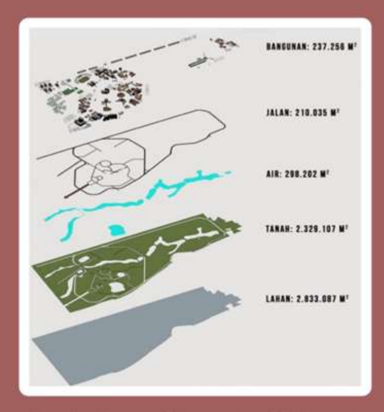
Detailed Area of University of Indonesia

University of Indonesia has 3.00 km² or 1.16 mi² total area and 7.78 km or 4.84 mi total distance. Detailed area are shown in the picture.